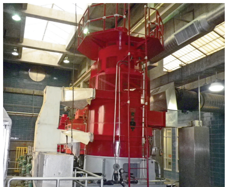
The clutch and motor atop the 1,650 hp Peerless pump make the unit three-stories high.

Incorporating the new digital eddy current control was relatively simple; the challenge was rewiring the starting circuit. The two plant technicians wired a 4160/240-volt, three-phase, step-down isolation transformer into the main medium-voltage synchronous starter and rewired the starter to make it